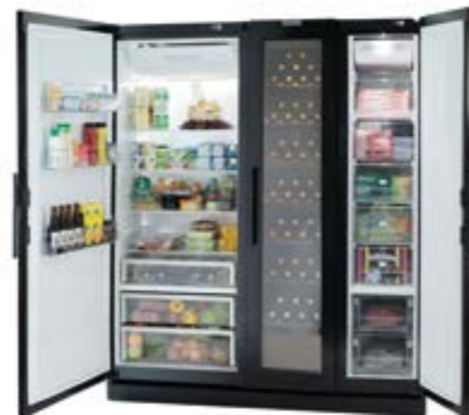
IMAGE: Festivo Trio includes either the 55 CM refrigerator or the 75 CM refrigerator, the 45 VLM wine cabinet and the 45 FM freezer.

Sustainability, durability, serviceability – these are the central qualities of Festivo. By choosing Festivo, you will get a top quality cold storage appliance made with precise Finnish expertise!