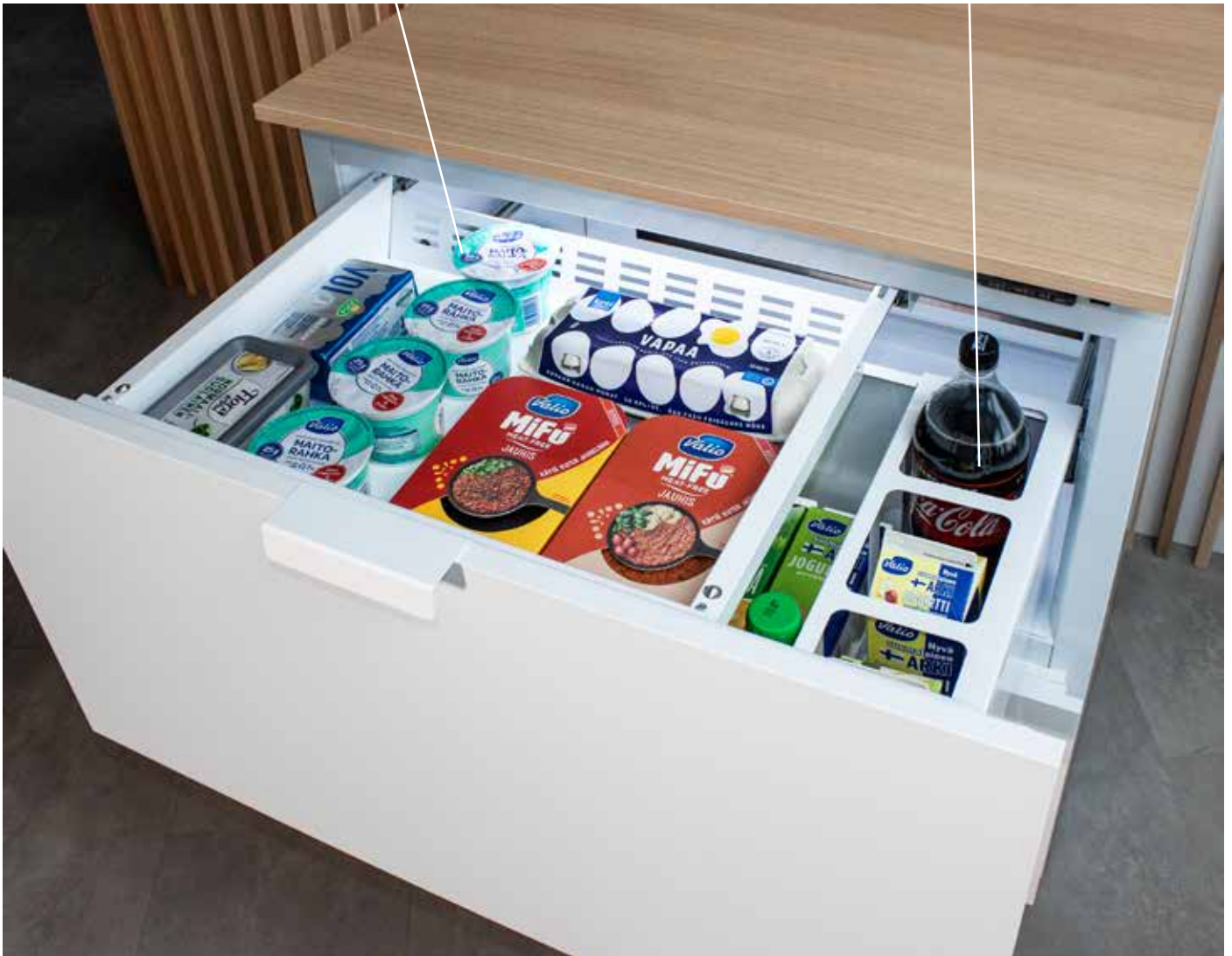
CAN AND BOTTLE RACK