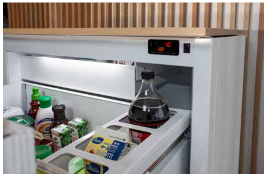
VERSATILE AND CONVERTIBLE COLD STORAGE BOX